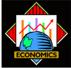
Microeconomics: Theory Through Applications